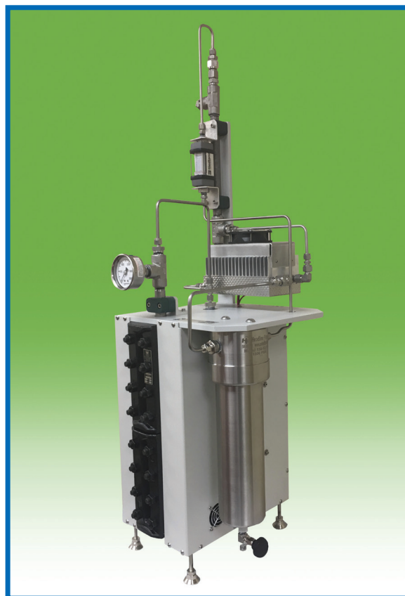
CannabisSFE - 3x1 CO 2 Optional Recycle